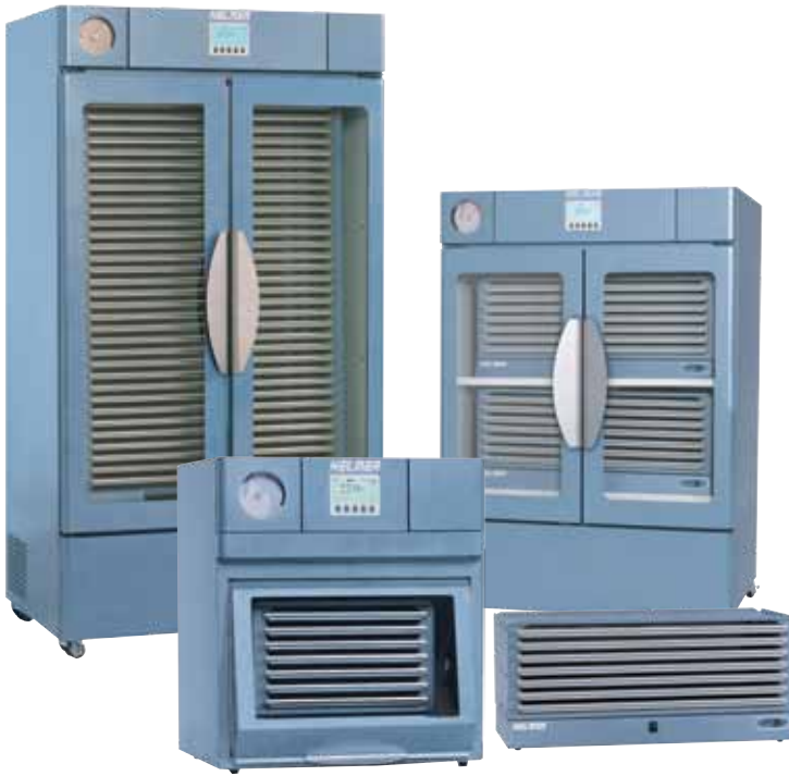
i.Series Models Shown Note: Platelet Incubators and Agitators sold separately.